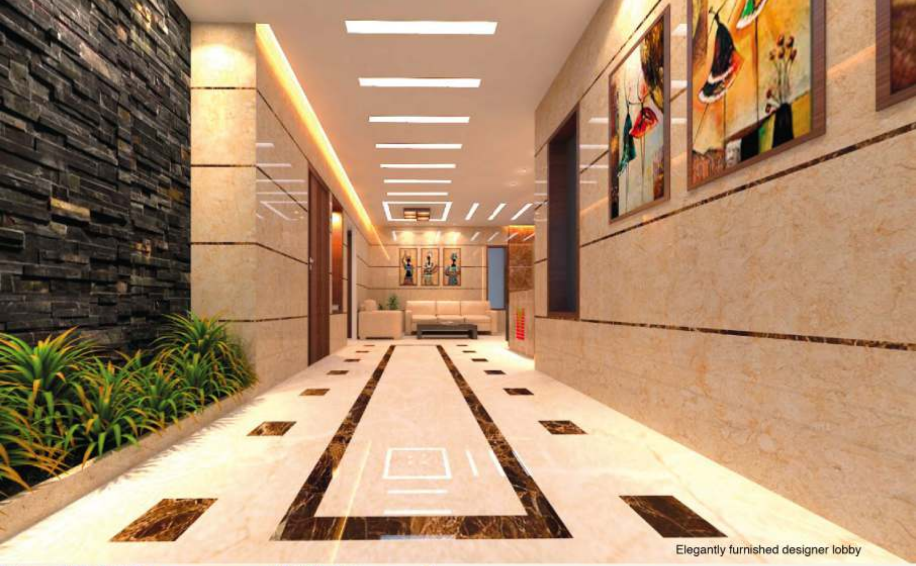
Elegantly furnished designer lobby