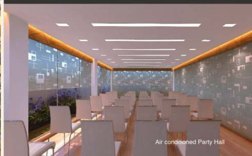
Air conditioned Party Hall