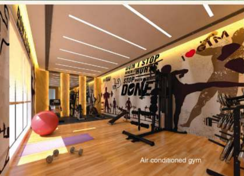
Air conditioned gym